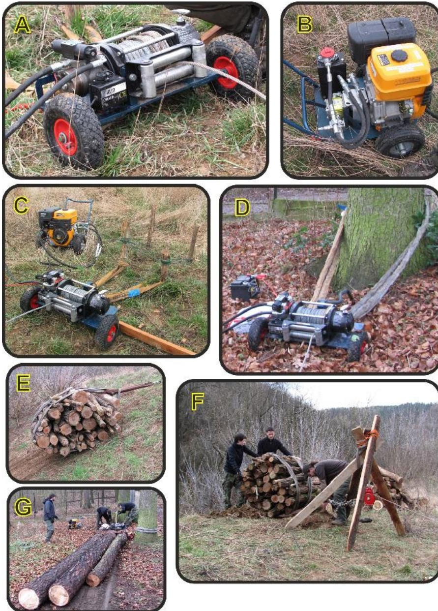
Fig. 2. Photographs of different ways of moving logs with the experimental winch. A) The hydraulic winch; B) generator; C) The winch is held in place by attachment to wooden pegs; the orange generator is in the rear; D) The winch is held in place by lashing it to a tree trunk; E) A bundle of timber being extracted from the forest with the winch; F) A bundle of timber being extracted by the directional pulley attached to a tetrapod; G) Extraction of three 4-m-long logs using the directional pulley attached to a tree trunk.

The mechanical winch can also be used to clear wood in extremely unfavourable conditions (Fig. 2).